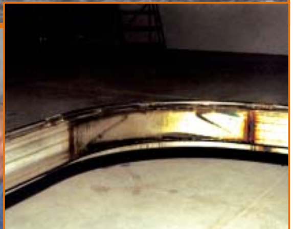
(Top photo) The butt joints used for the destructive and non-destructive tests had a 37 1/2° bevel and 1/8 in. gap. The flux was brushed on the backside of the weld. Gardener made two weld passes in the joint.